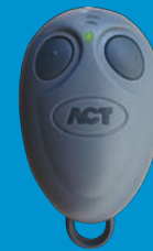
ACT 433TX / ACT 433TXprox Transmitter