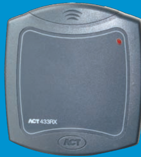
ACT 433RX Receiver