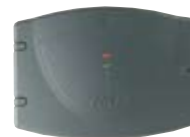
ACTpro 100 Door Expander